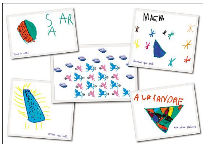
Fig. 1. Four of the drawings of crystals produced by 5-year-old participants from a class of the Primary School Vélodrome. One of the illustrations used to explain in simple terms how crystals grow from dissolved cations (pink angels) and anions (blue cupids) when water (grey clouds) slowly evaporates is shown in the centre.

During and after the crystal growth period, many positive feed-backs on the contest and fancy correspondence were sent by participants from all levels. For example, a teacher sent us a very detailed identification of the unknown salt received, using pH, solubility tests and simple chemical reactions for major ions, and even a flame emission test for cations; the teacher concluded, on the basis of her observations and the fact that the salt could favour algal growth, that the unknown salt contained potassium and phosphates, most probably a mono- or dipotassium phosphate! Several Primary level classes competed in the same school to obtain the nicest and most exotic crystal. The 26 children of a French Primary level class even sent each a handwritten letter to the committee, asking to take part in the contest. In another